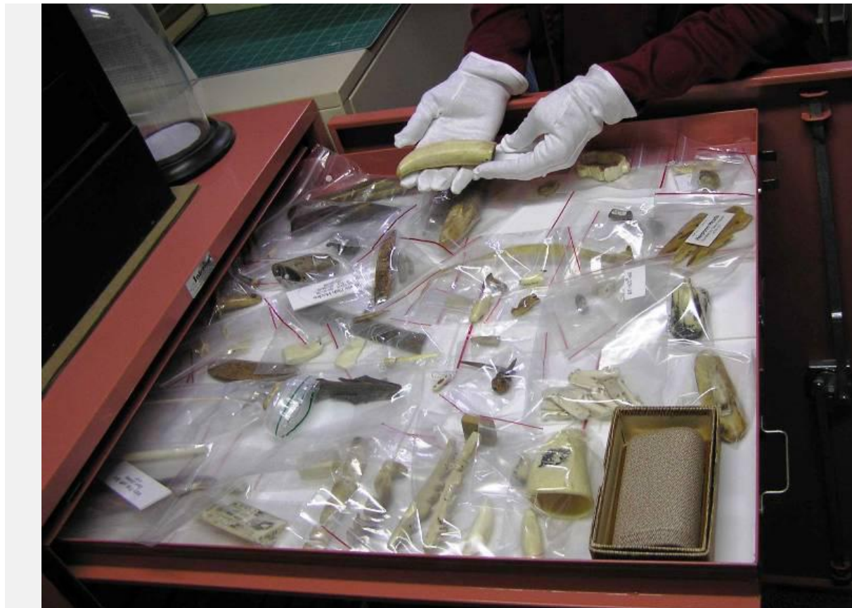
Ivory Storage Before