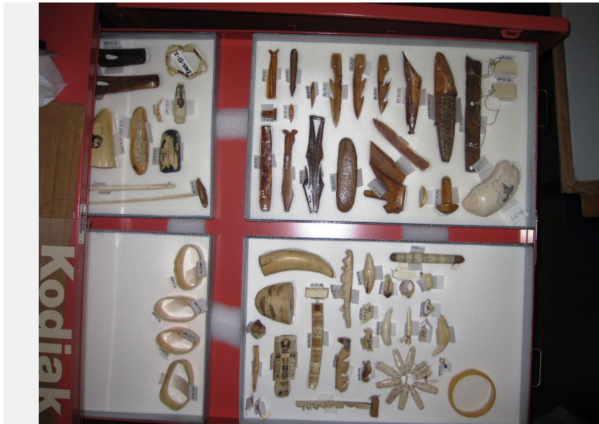
Ivory Storage After

Fran was able to accomplish all of the deliverables identified in the grant and complete additional priorities outlined in our 2007 Collections Conservation Assessment.